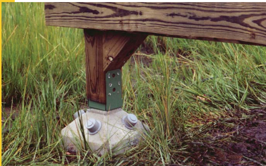
Engineered Diamond Pier foundations fit into any low impact design strategy, bringing an environmental solution to a wide variety of construction sites.