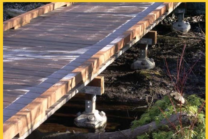
Wetland, tidal, and sensitive sites benefit from the Diamond Pier foundation's substantial load capacities in marginal, saturated soils.

Call 253-858-8809 or 866-255-9478 (Toll Free) www.diamondpiers.com