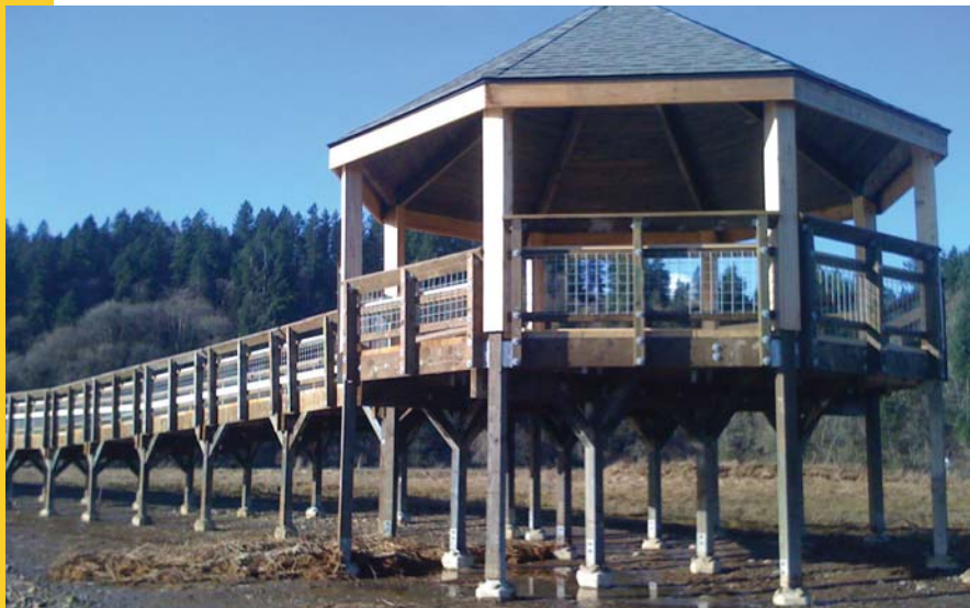
High-strength concrete heads with driven steel bearing pins provide resilient, durable foundations for boardwalks, stairways, bridges, pavilions, and overlooks.