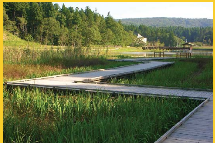
The low impact installation of Diamond Pier foundations is ideal for bringing visitors to ecologically sensitive and captivating environments.