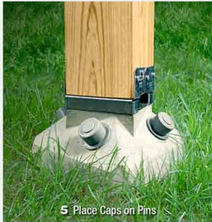
5 Place Caps on Pins

Tips: Layout string approx. 12-14" above the ground on center location of post/pier for a quick reference point. Keeping the pin centered in the driving hole, carefully set pin 6" to 12" into the soil tapping with the sledgehammer until the pier is locked into a level position. With the automatic hammer, drive pins evenly from side to side in equal increments approx. 1' to 2', until pin is approx. 3/4" out to fit cap. One person should hold the pin, limiting vibration to the pier while pin is driven. The edges of the top of the concrete pier do not have to align exactly with the sides of the post or post bracket as long as the bracket is fully supported by the concrete for proper weight distribution. Piers can be nested next to each other to provide more loading, but if closer than 3' on-center, a 13% load reduction should be applied to each pier.