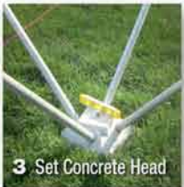
3 Set Concrete Head