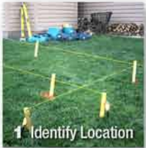
1 Identify Location

Site requirements: Normal Soil Conditions, properly drained, maximum slope 2:1, see full Installation Manual. Determine Proper Model Size: Reference Residential Diamond Pier Load Chart at www.DiamondPiers.com . Example: DP50-50" model is equivalent to an 18" cylinder traditional concrete pier, 48" frost zone rating. Submit Building Permit Application to Local Municipality: List Diamond Pier model size. Provide documents supporting code compliancy from downloads at www.DiamondPiers.com . Install in Minutes: A minimum two-person crew is recommended.