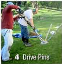
4 Drive Pins