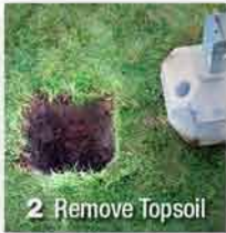
2 Remove Topsoil